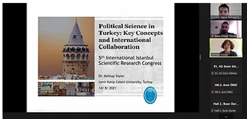
Photos of our previous congresses held online